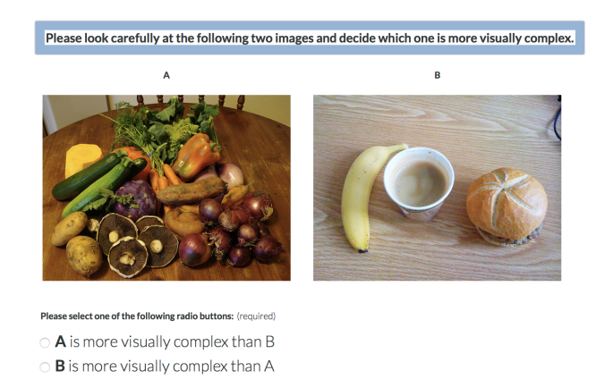
Figure 2: Screenshot of one of the pairwise comparisons shown to Figure-Eight contributors for the objects category.

Test questions, geared towards quality control, were distributed to contributors randomly throughout the entire job to make sure they are attentive to the task. While all the comparison tasks were paid, only the answers from the contributors who maintain a passing score of 90% or above on test questions were kept.