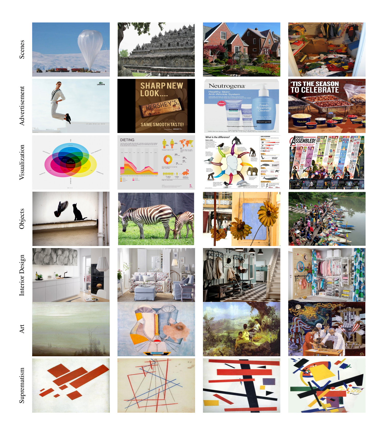
Table 2: Sample images of the SAVOIAS dataset with increased visual complexity from left to right in each row.