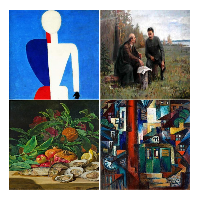
Figure 1: Sample images of the Art category of SAVOIAS (styles Suprematism, Socialist Realism, Biedermeier, and Cubofuturism [47]) shown in increasing order of ground-truth visual complexity scores (10, 55, 71, and 83 out of 100).