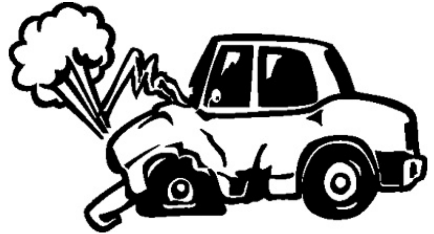
Knight Capital Group